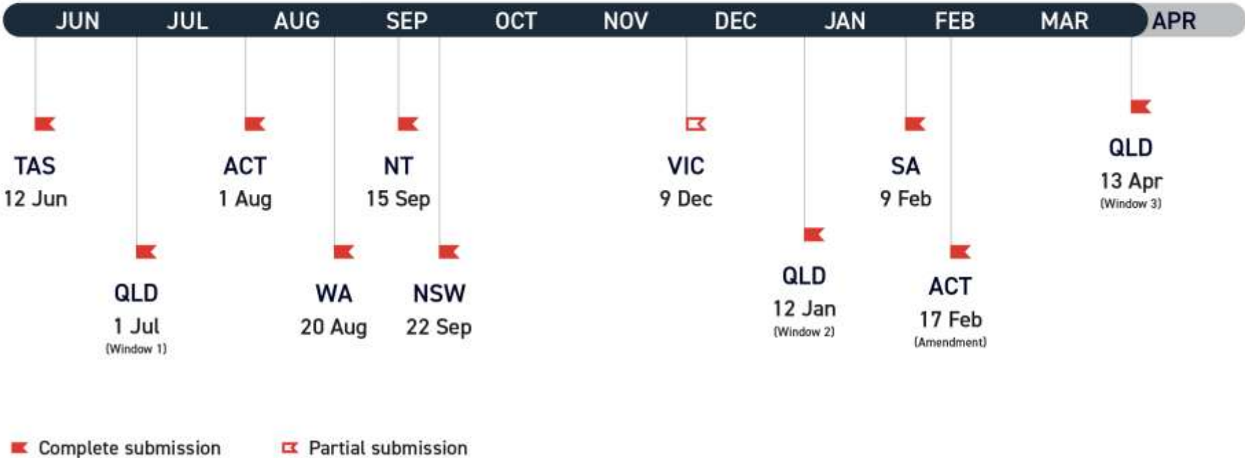
2025-26 Service Agreement Provision Timeline